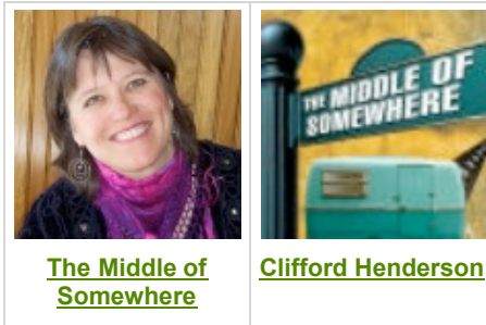
The Middle of Somewhere